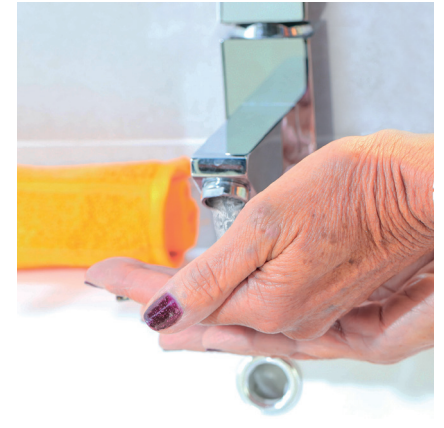
Wash your hands thoroughly after changing.

For further information or samples about our pouches, visit us at www.dansac.co.uk