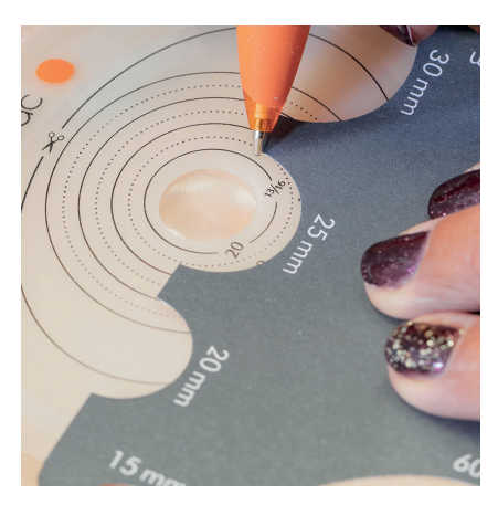
After you have measured your stoma, use the stoma guide or template to transfer the size and shape of your stoma onto the cutting guide of the adhesive skin barrier.