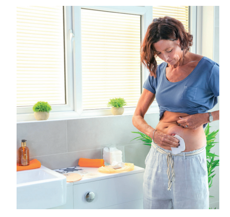
It is important that the skin surrounding your stoma is completely dry before putting on a new adhesive skin barrier and/or pouch.