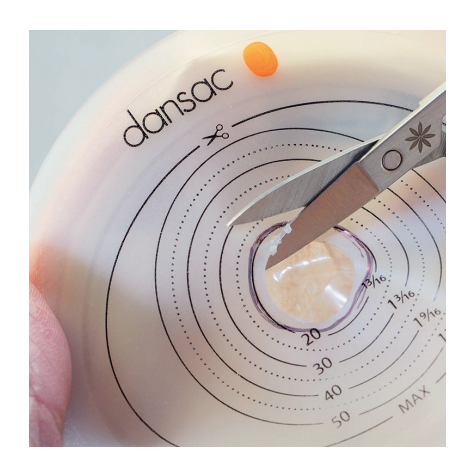
Adjust the starter hole with small, sharp scissors taking care to follow the outside edge of the marking. Make sure the hole fits snugly to your stoma. Cut the barrier as measured by the stoma guide.