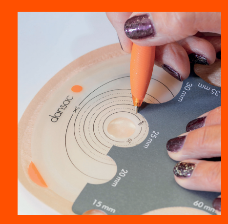
After you have measured your stoma, use the stoma guide or template to stoma onto the cutting guide of the adhesive barrier.