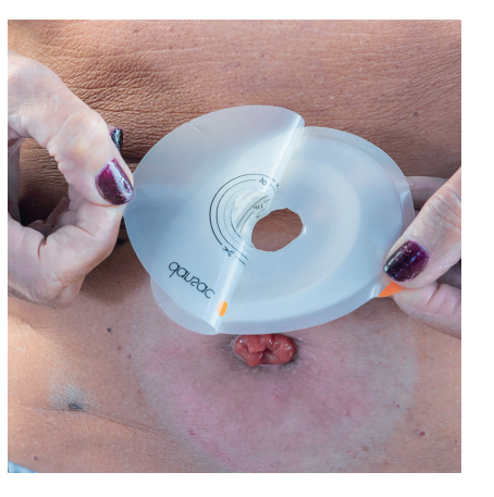
To apply the new skin barrier, remove the protective covering of the adhesive barrier immediately before application.