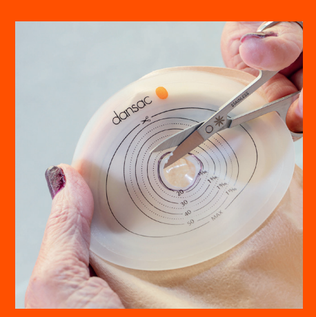
Adjust the starter hole with small scissors taking care to follow the