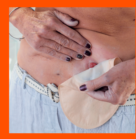
Gently remove the pouch: tighten the skin on your abdomen by pressing it with warm water and thoroughly dry the skin around the stoma.