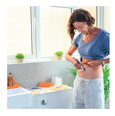
Dampen a few dry wipes in lukewarm water. Clean around your stoma and surrounding skin thoroughly.