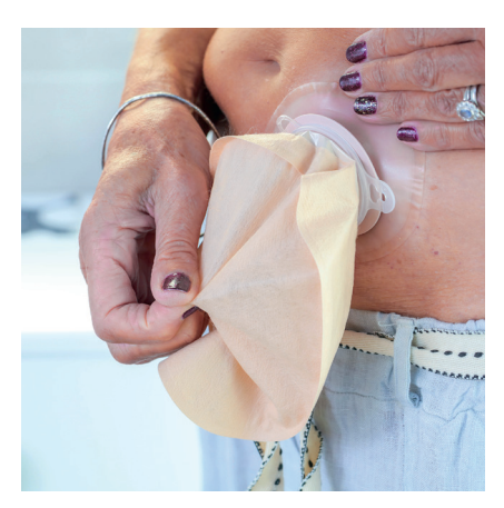
Double check that the pouch is securely connected to the barrier ring by gently pulling at the pouch.