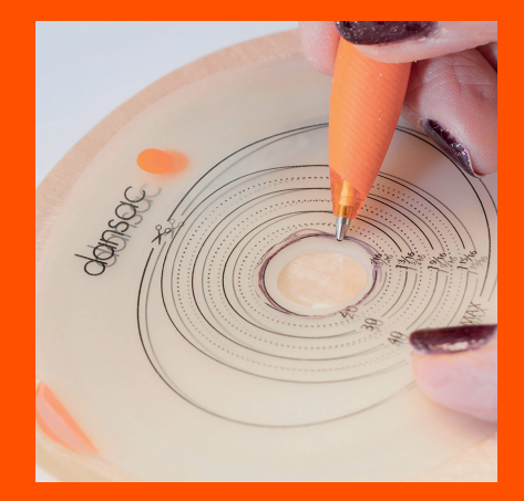
Cut the barrier as measured by the stoma guide.