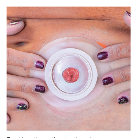
Position the adhesive barrier over your stoma. Press the barrier with your fingers from the centre to the edge to ensure it fits snugly and securely.